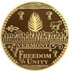
Philip B. Scott Governor

Given under my hand and the Great Seal of the State of Vermont on this 20th day of March, A.D. 2018.