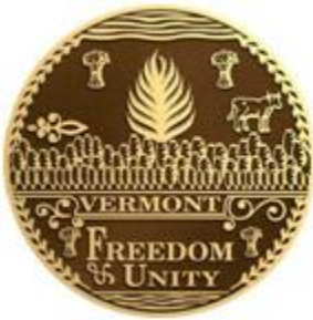
Philip B. Scott Governor

Given under my hand and the Great Seal of the State of Vermont on this 3rd day of April, A.D. 2018.