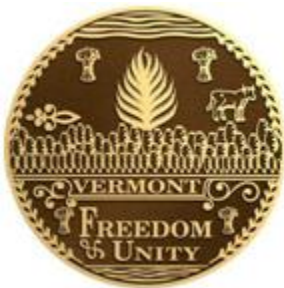
Philip B. Scott Governor

Given under my hand and the Great Seal of the State of Vermont on this 10th day of April, A.D. 2018