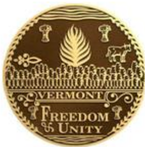
Philip B. Scott Governor

Given under my hand and the Great Seal of the State of Vermont on this 29th day of March, A.D. 2018