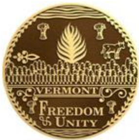
Philip B. Scott Governor

Given under my hand and the Great Seal of the State of Vermont on this 12th day of April, A.D. 2018